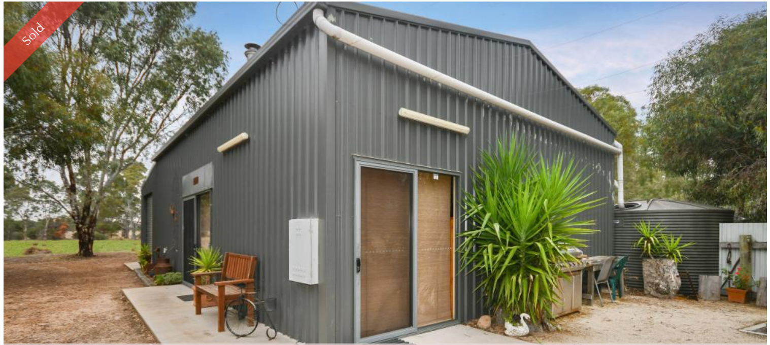
Lot 1, 1483 Grampians Rd Fyans Creek Via, Halls Gap