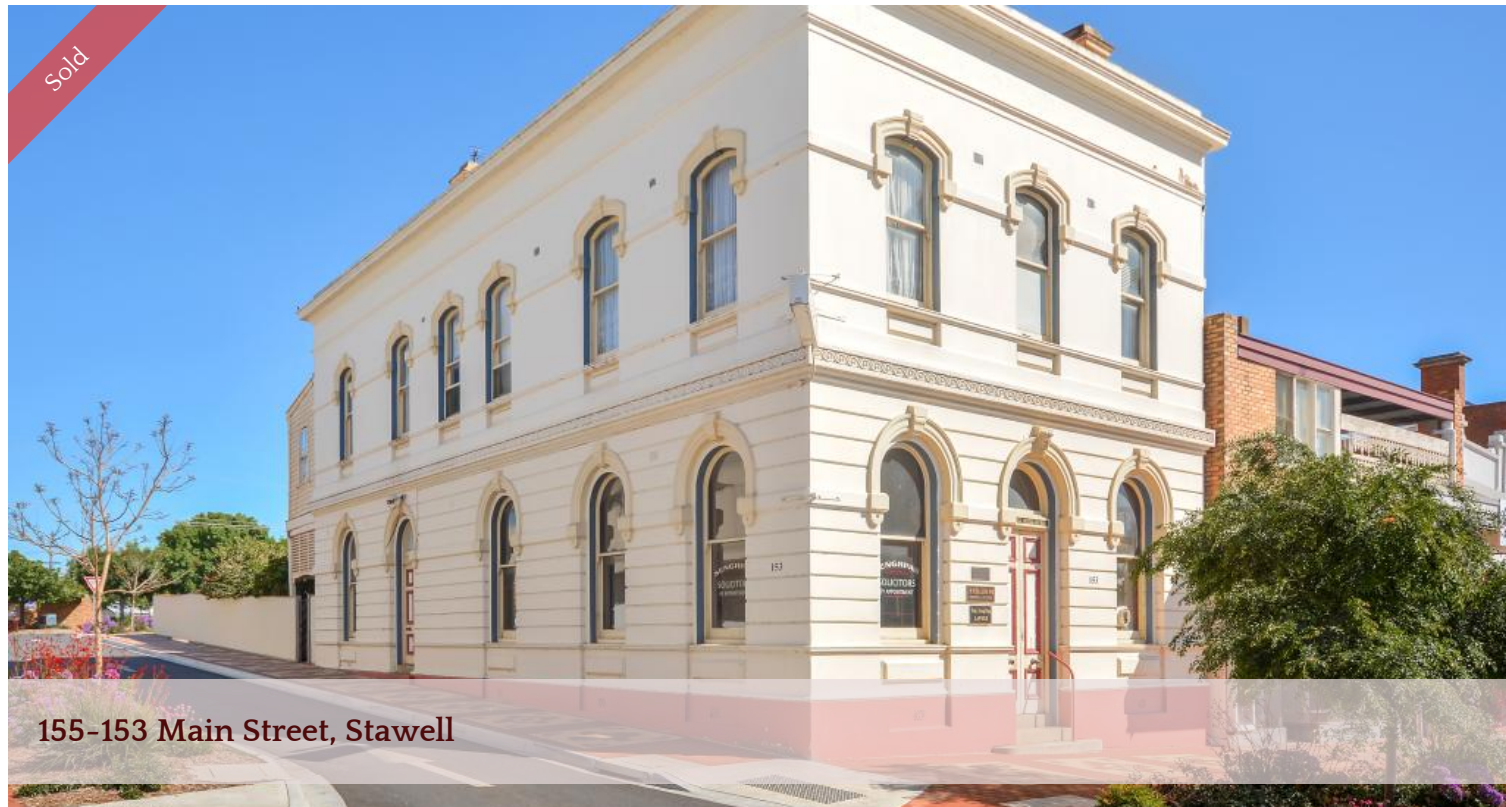
155-153 Main Street, Stawell