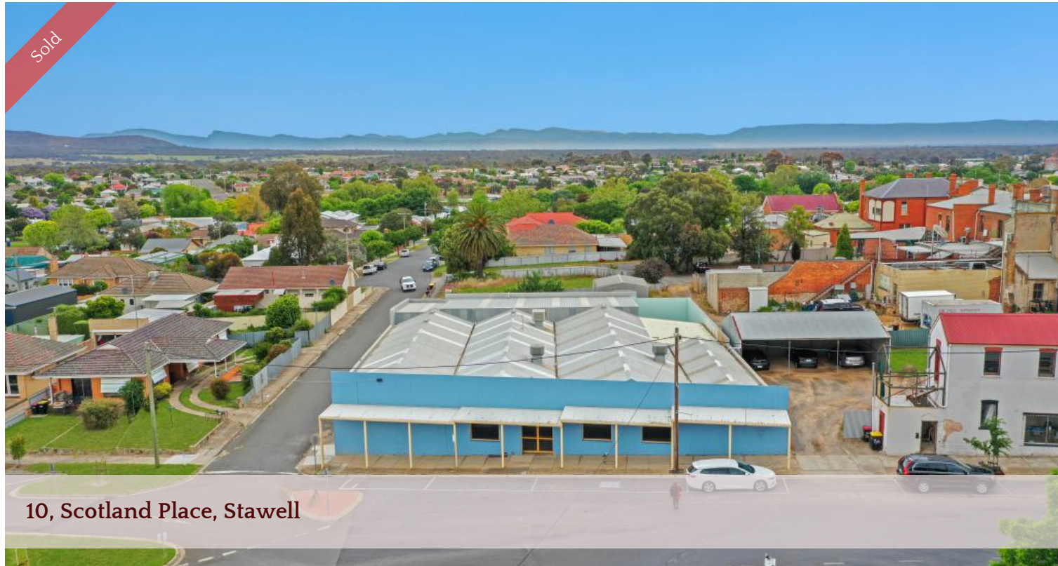
10, Scotland Place, Stawell