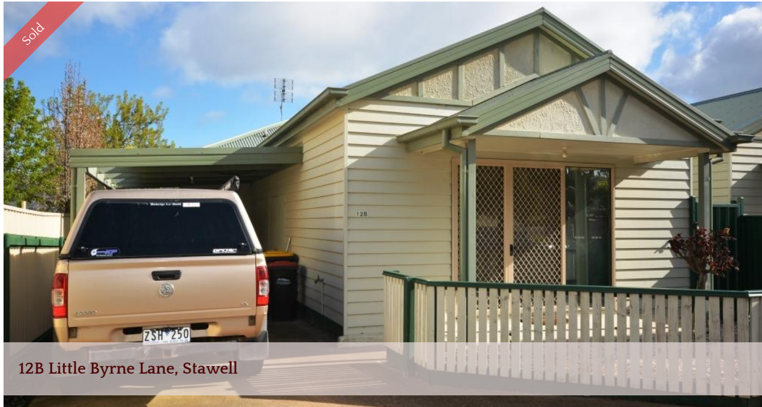
12B Little Byrne Lane, Stawell