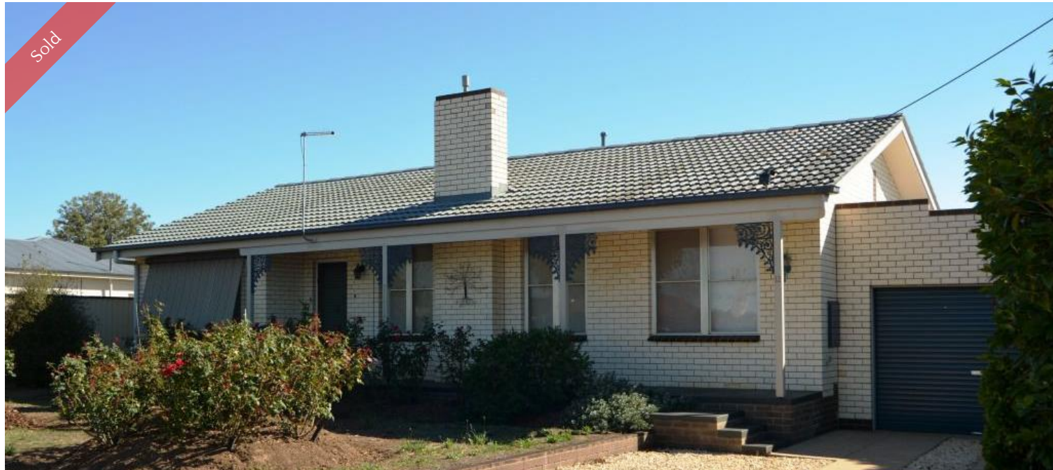
13 Moonlight Street, Stawell